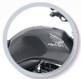
Matt. Axis Grey Metallic