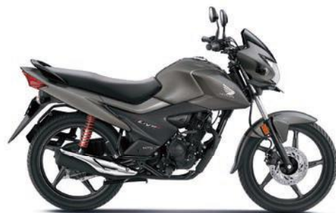
MATT CRUST METALLIC